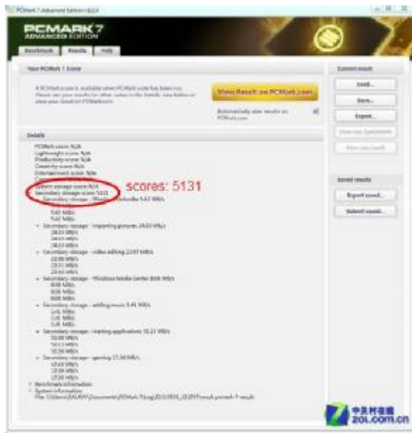
[With native SATA-III connection]