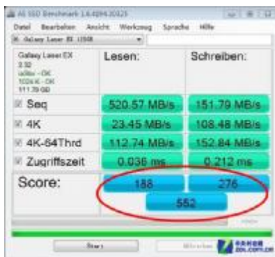
[Performance test: AHCI turned on]